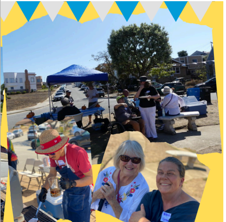
Annual Oktoberfest Picnic